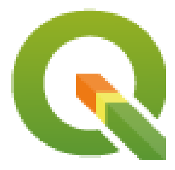
Fig. 2.1: A caption: A logo I like

To avoid conflicts with other references, always begin figure anchors with _figure_ and use terms that easily connect to the figure caption. While only the centered alignment is mandatory for the image, feel free to use any other options for figures (such as width, height, scale...) if needed.